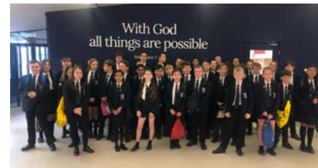
Picture of all the prize winners.

I was delighted with the number of different pupils that received awards at Lower School Presentation Evening on 27th June. It is important that we recognise achievements and effort in as many pupils as we can and the evening was a testament to this.